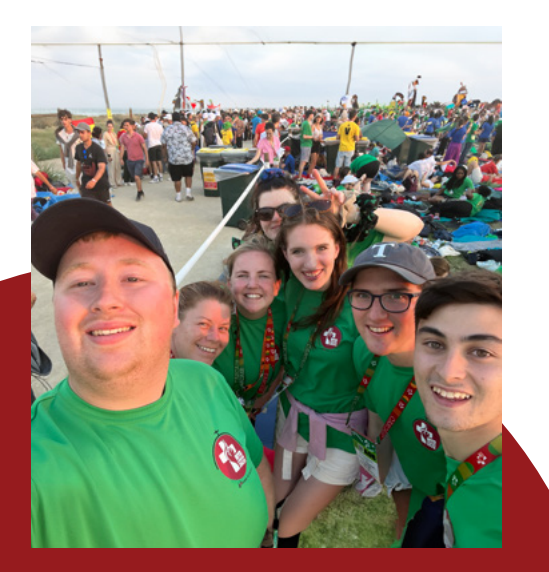
Pilgrims from the Archdiocese of Dublin at World Youth Day in Lisbon

The purpose of the Office of Mission & Ministry is to support and resource faith development in every community of the Archdiocese so that each person can actively participate in the life of their parish. We do this by accompanying teams and individuals, offering continuous training and formation opportunities. These include training of Parish Pastoral Councils, adult faith formation, liturgical resourcing, developing youth and young adult leadership and supporting the development of voluntary ministries. We open ourselves to the challenge and opportunities provided by change, working alongside each other to effect renewal. We strive to ground all we do in the mission and ministry of Jesus.